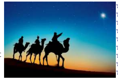
They followed the bright star

The Feast of the Epiphany of Our Lord Jesus Christ is one of the oldest Christian feasts, though, throughout the centuries, it has celebrated a variety of things. Epiphany comes from a Greek verb meaning "to reveal," and all of the various events celebrated by the Feast of the Epiphany are revelations of Christ to man. Epiphany celebrates the visit of the three kings or wise men to the Christ Child, signifying the extension of salvation to the Gentiles.